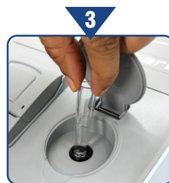
Insert R1 + Sample