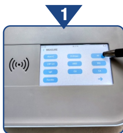
Select Test from Menu